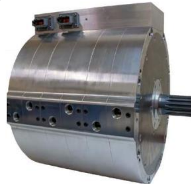
Turntide AF340 (with shaft seal)