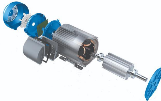
Figure 1. Turntide high-rotor pole switched reluctance motor

It is estimated that 38.4% of the total U.S. electrical energy consumption is used to run motors. 1 Annually, 45 billion kWh are used by 1-10 horsepower motors, alone. Even a small increase in motor efficiency could greatly reduce energy consumption. Turntide has developed a patented High Rotor-Pole Switched Reluctance Motor (HRSRM) system that can achieve up to 95% peak motor efficiency and maintain similarly high levels of performance over a wide range of operating speeds. Figure 1 shows the Turntide switched reluctance motor.